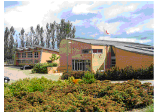
Side view of the building

The National Energy Centre is in Milton Keynes about 3km South of the city centre on Davy Avenue, just off H7 Chaffron Way which runs parallel to the North of the A421.